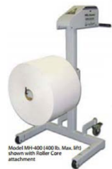
Model MH-400 (400 lb. Max. lift) shown with Roller Core attachment